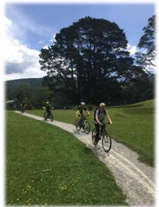
Class 8 Bike Camp (story inside)