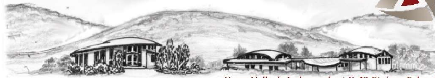
Yarra Valley's Independent K-12 Steiner School