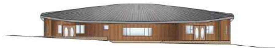
New Preschool design